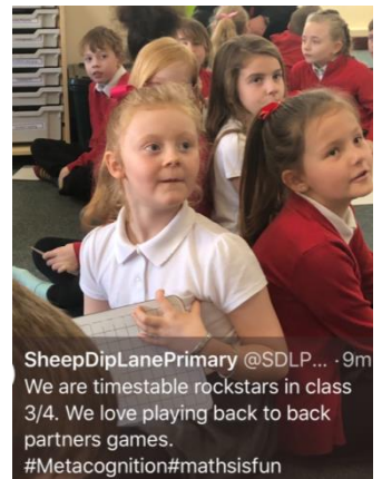
SheepDipLanePrimary @SDLP... · 9m We are timestable rockstars in class 3/4. We love playing back to back partners games. #Metacognition#mathsisfun

Red Nose in a Box – on sale from Monday 4 th March £1.25 each Which one will you get?